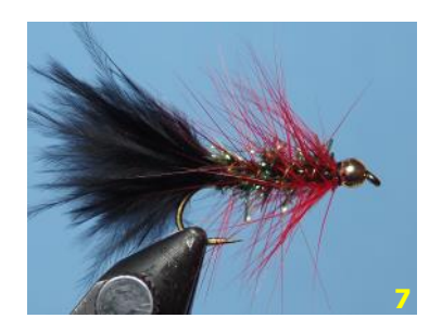
Tight Lines & Good Luck!